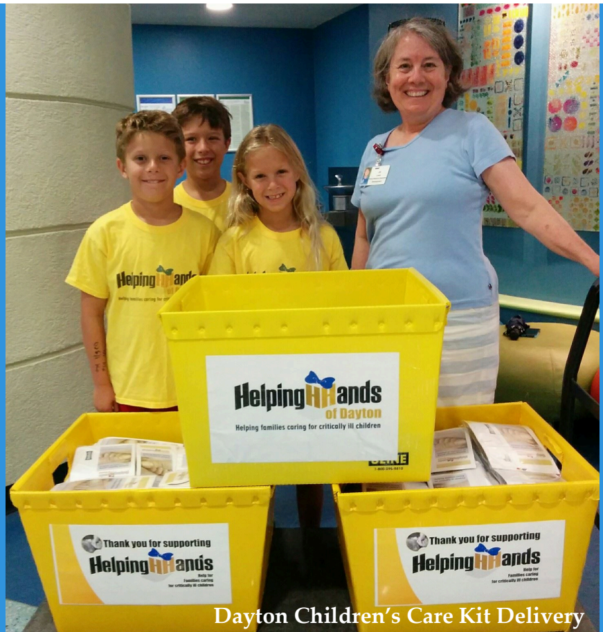
Dayton Children's Care Kit Delivery