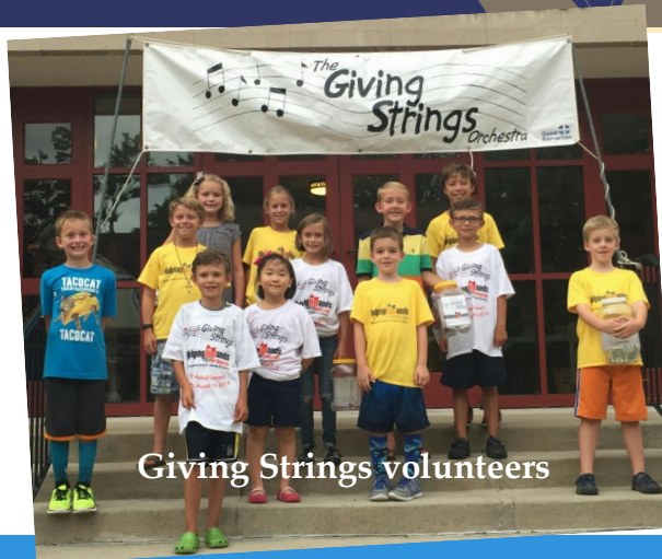
Giving Strings volunteers